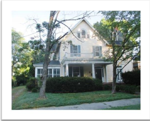
316 Park Ave, Salisbury, MD 21801 MLS #: 505834 $74,900

These two properties in foreclosure were recently listed for sale by their bank owners. This is good news for Newtown because it indicates that our housing market is picking up. Check out these great bargains for your friends, family, or yourself!