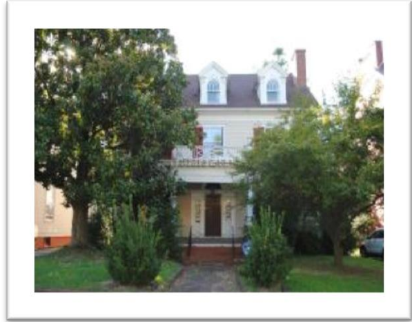
326 N Division St, Salisbury, MD 21801 MLS #: 506276 $126,500

4 beds, 2 baths, 3,358 sqft. Come look at this older home built in 1896 with more than 3300 square feet of living space. This property features 4 bedrooms, living room, fireplace, family room, 2 full baths, sunroom, screened porch, and detached 5-bay garage. Bring your ideas and your tools and restore this home to its original glory. This is a Fannie Mae HomePath property.